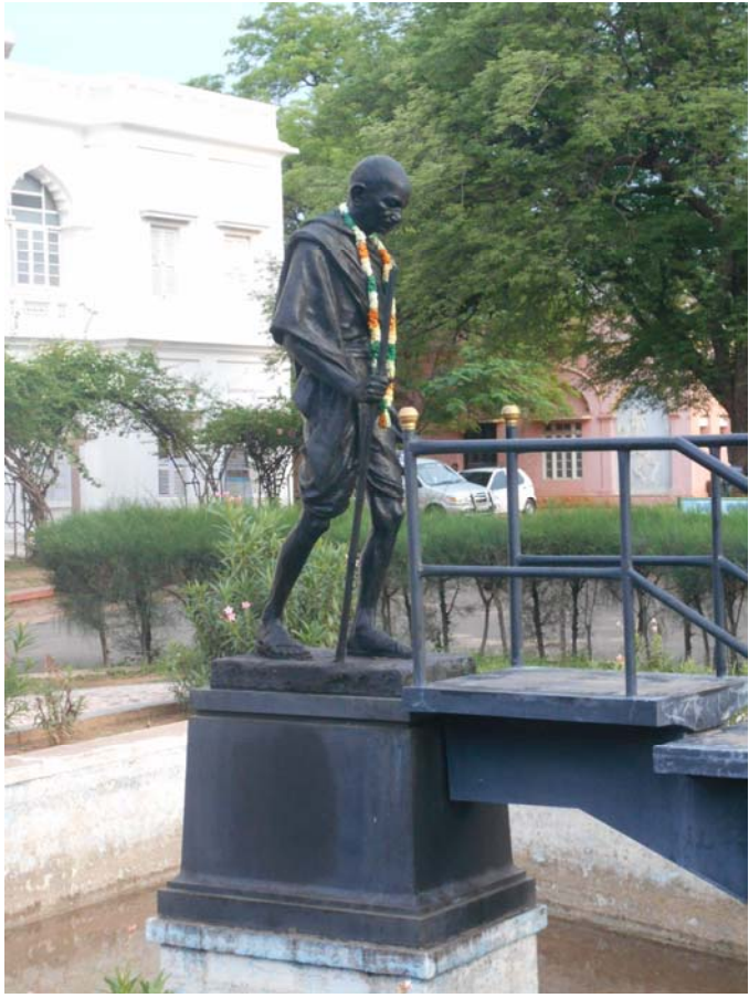
We went to the Ghandi Museum just in time to learn that it was observing Holiday Hours. Ghandi is a prominent figure everywhere in India, but in Madurai he refused to enter the Meenakshi Temple if members of the Untouchable chaste were forbidden to enter.