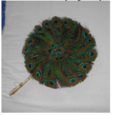
My Big Score- A fan with a story!