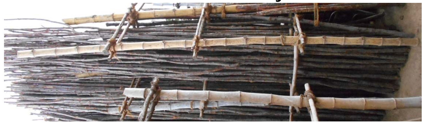
Tuesday 8 October 2013