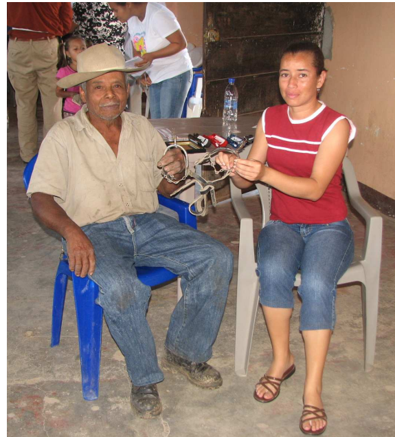
This 80 vanquero brought his spurs with him, but took them off for the exam. We were going as fast as we could, but I was still grateful for him not spurring us along.