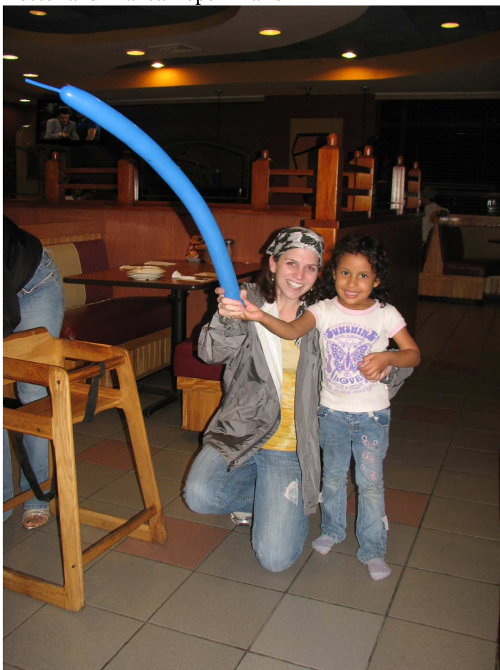
Zombie Slayer in Training