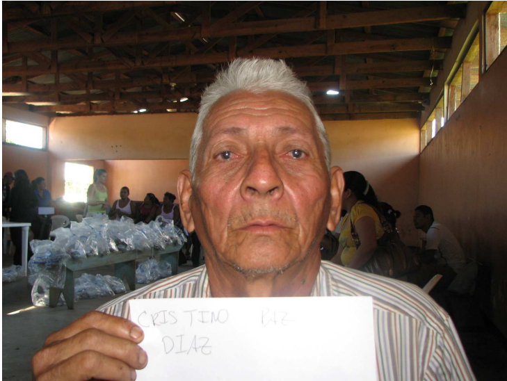
Unfortunately for this gentleman, his undiagnosed glaucoma resulted in blindness in each eye.