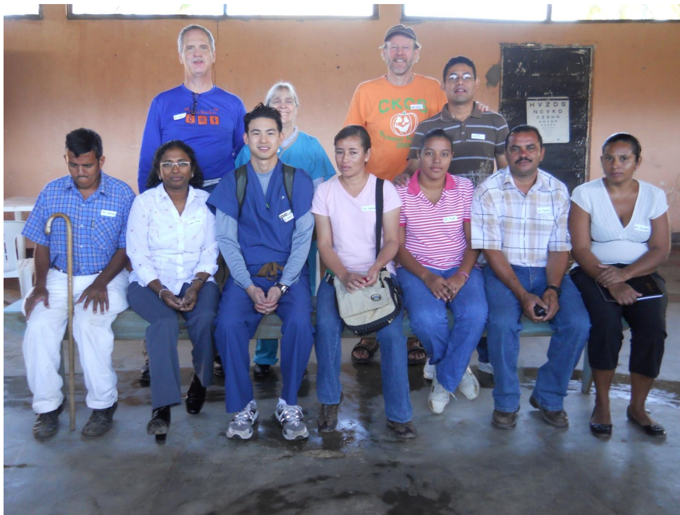
Eye Brigade January 2011