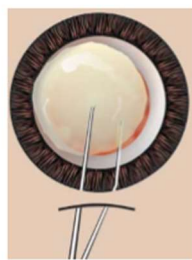
Fig 4.6-2 Bimanual technique of nucleus prolapse into the anterior chamber